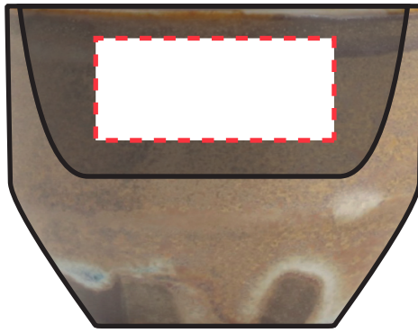
Binnenzijde: 35 x 15 mm