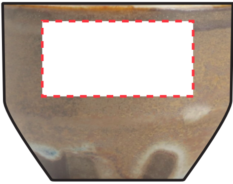
Basispositie: 40 x 20 mm