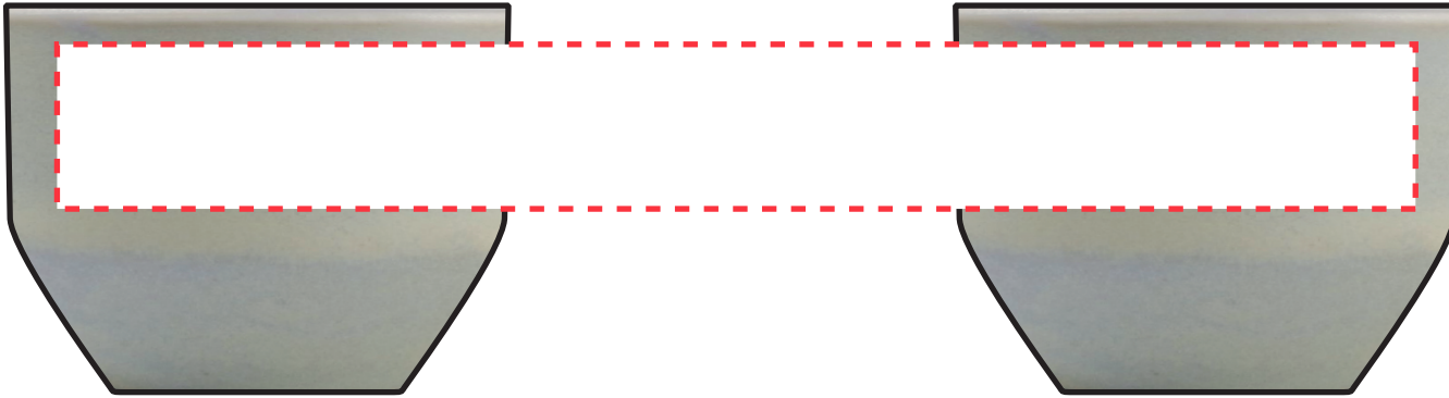
Rondom: 165 x 20 mm